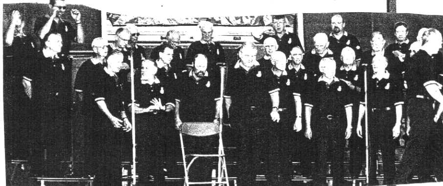
Changing music directors on IPM'S platinum stage