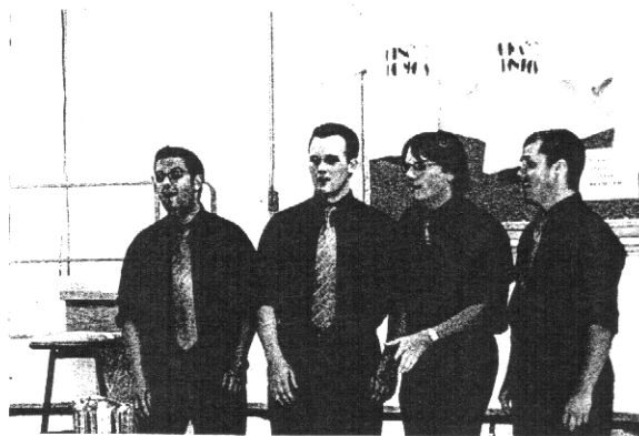
"Gin & Tonics"